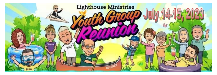
A "youth group style" reunion for reconnecting, sharing stories, playing together, and encouraging one another in Christ's love! Join the conversation on Facebook!